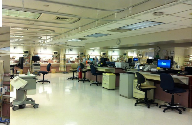
UPMC Shadyside PACU