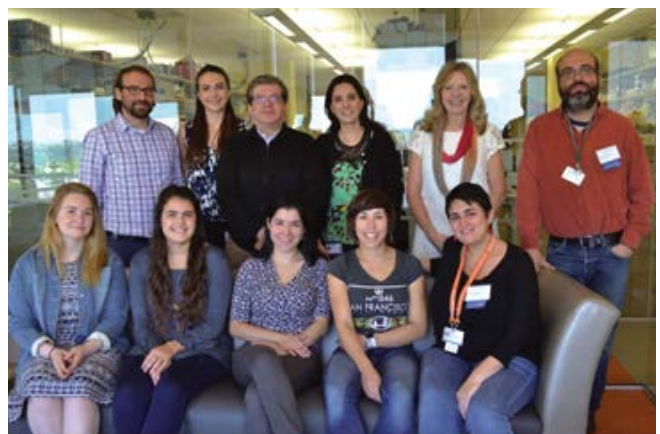
Rojas Lab Team Members